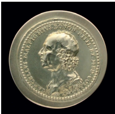
Malpighi awardee at ECM 2011 in Munich